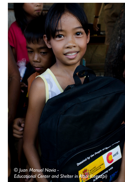
© Juan Manuel Navia - Educational Center and Shelter in Alcala (Laguzpi)