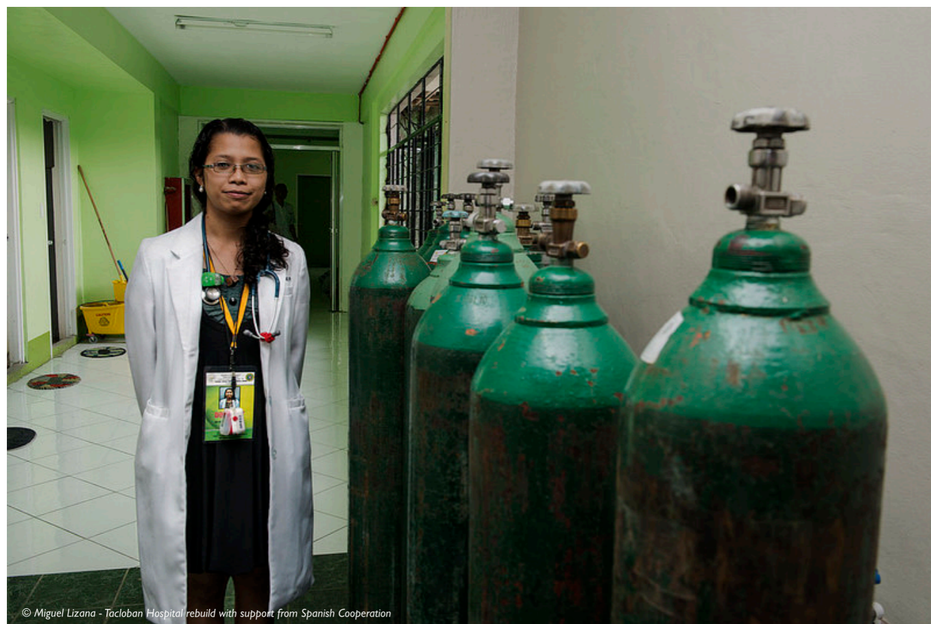
Tacloban Hospital rebuild with support from Spanish Cooperation