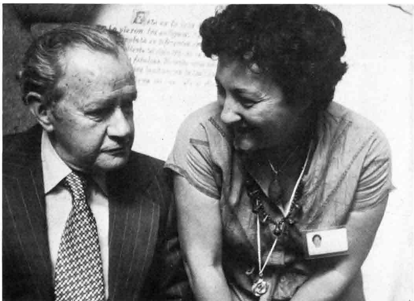
Con la poeta Francisca Aguirre.